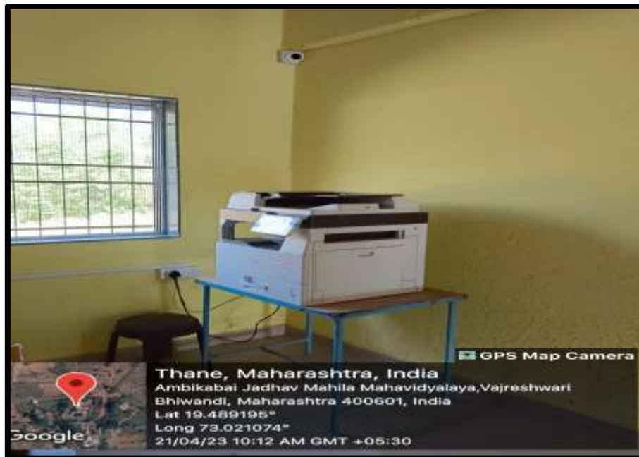
Figure 2- Xerox Machine