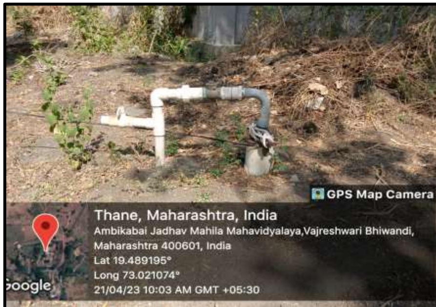
Figure 10- Borewell