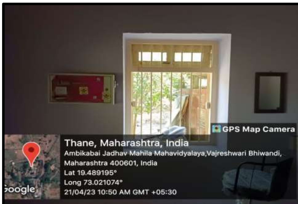
Figure 4- Sanitary Pad Machine