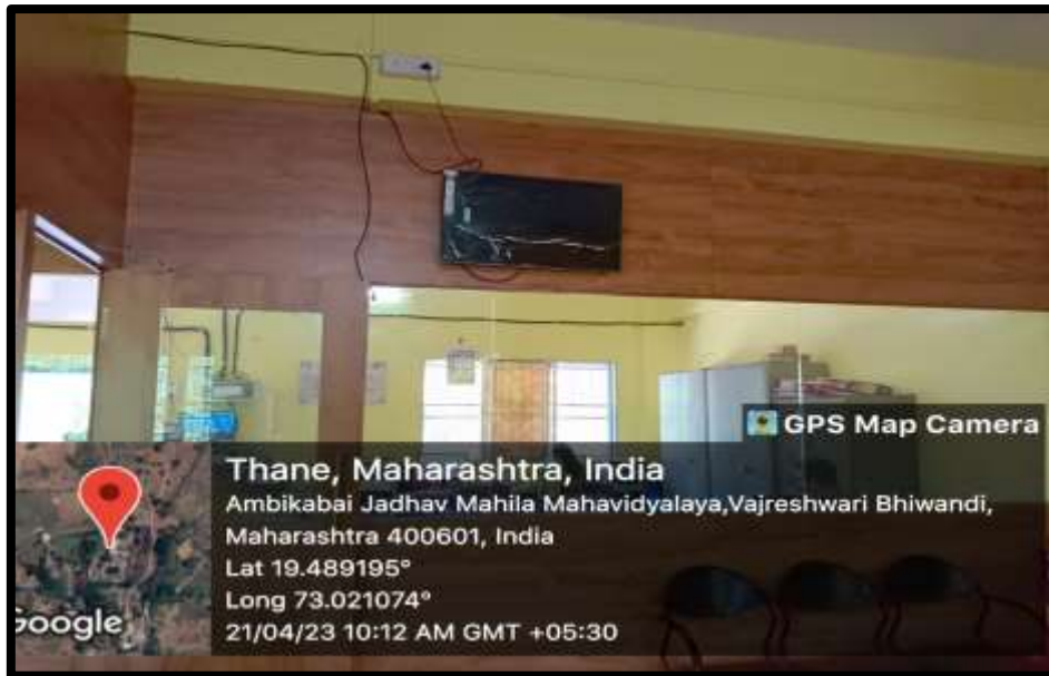
Figure 3 - Television