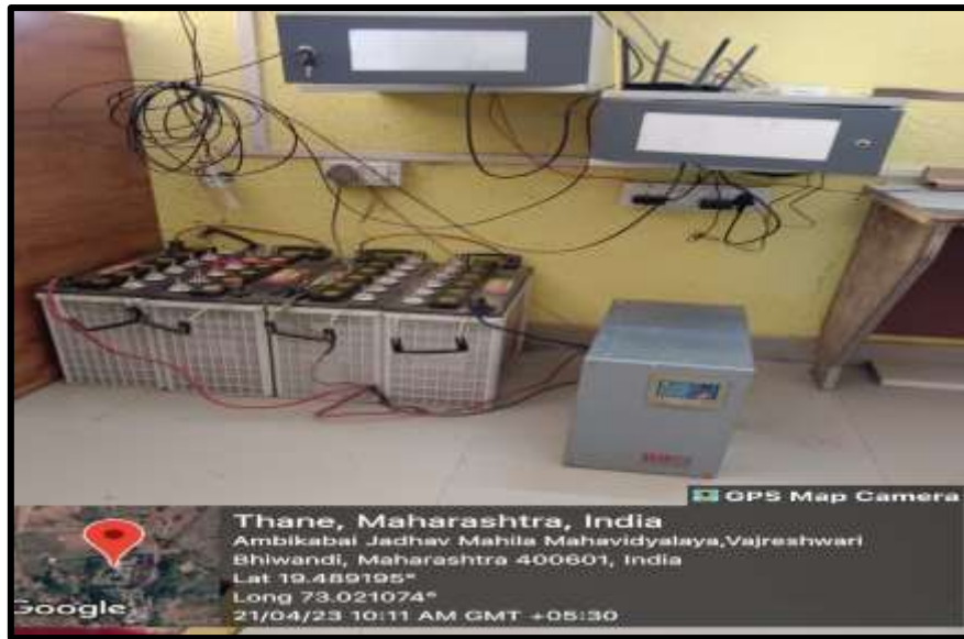
Figure 9- Main Building Wi-Fi Section