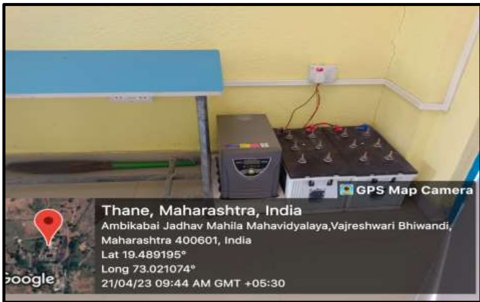
Figure 6- Power Backup (Inverter and Battery Backup)