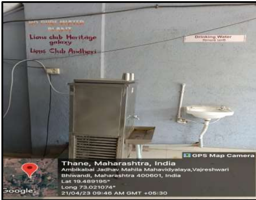
Figure 7- Purified Drinking Water Facility