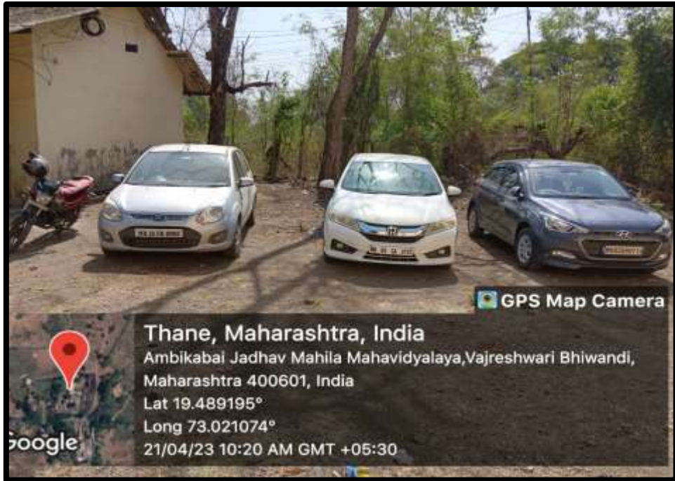
Figure 5- Parking