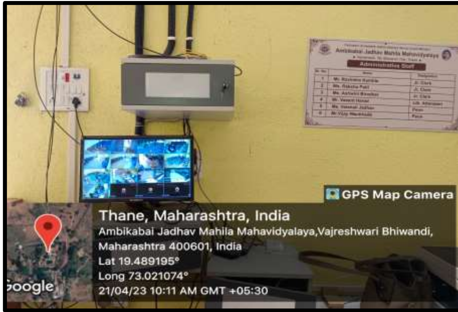
Figure 1- CCTV