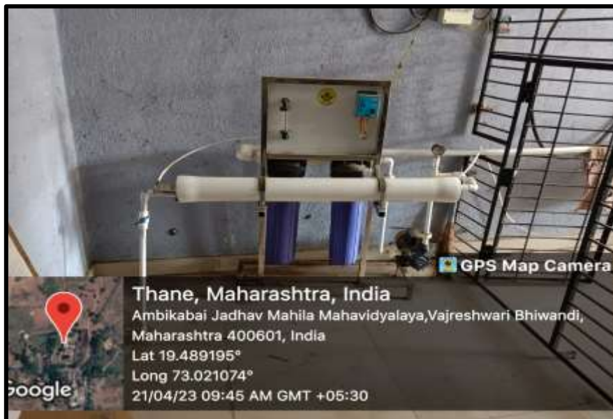
Figure 8- Portable Water Facility Machine